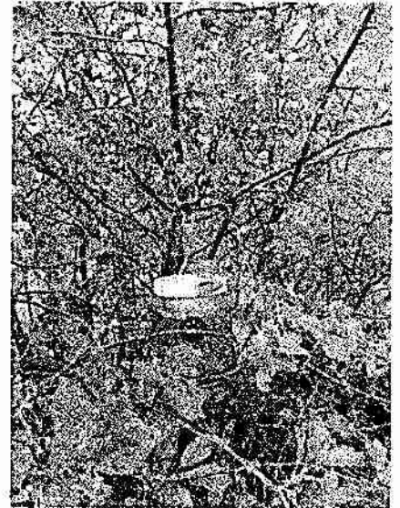
Spotted Wing Drosophila trap

As the growing season continues, the Plant Health Officers have been participating in the Ministry of Agriculture pest surveys across the province, including insect surveys of Diamondback Moth, Aster Leafhopper, Bertha Armyworm, Spotted Wing Drosophila Fly, Swede Midge and Pea Leaf Weevil. As well as disease surveys of field pea, chickpea, lentil, soybean and canola. The 2021 Clubroot Monitoring Program and Provincial Clubroot survey will start in August and continue up to late September. If you would like to participate and have your fields surveyed for insects or disease you can sign up to be on the producer database at https://ca.surveygizmo.com/s3/50060966/Pest-Monitoring-Sign-up .